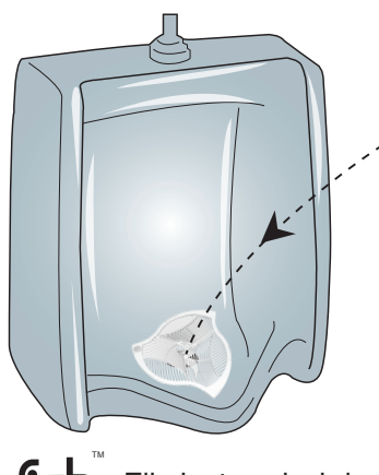
: Eliminate splash-back